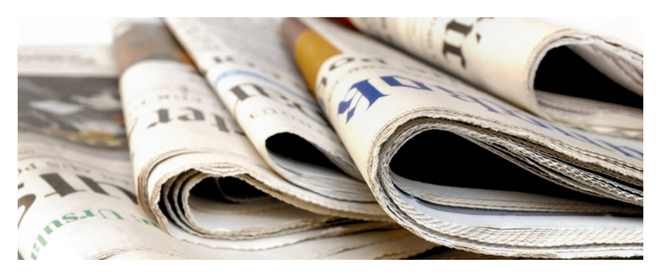
group - Punch Newspaper, which also has a significant following. This Punch account is not associated with the real newspaper, but is clearly affiliated with SpyNigeria because it often posts content from that source, which we were able to confirm through CrowdTangle - a social media analytics tool.

The second emergent theme focused on the issue of the fear of Nigeria's Islamisation. In January 2018, CDD responded to a 55-second video, titled: "The Church of Christ in Nigeria in Danger!", which emerged on social media - especially on WhatsApp and Facebook. The video claimed that the Nigerian government had concluded plans to set up an agency to monitor churches across the country.