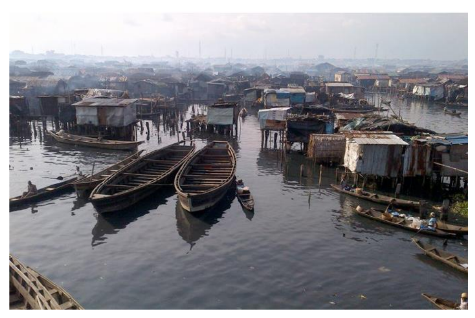
Figure 2: Makoko.