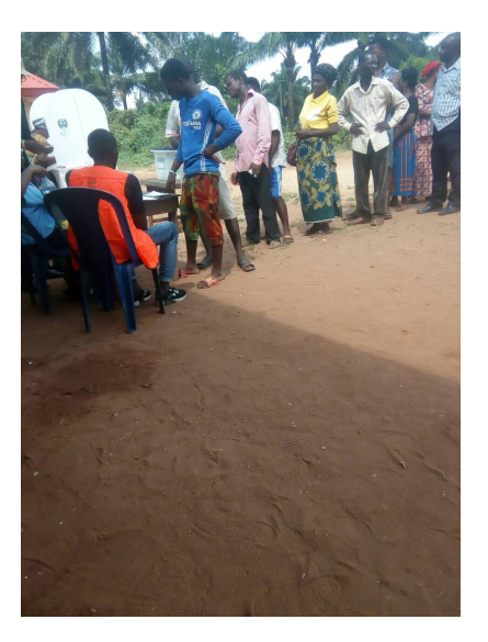
Low voter's turnout in the LGA's