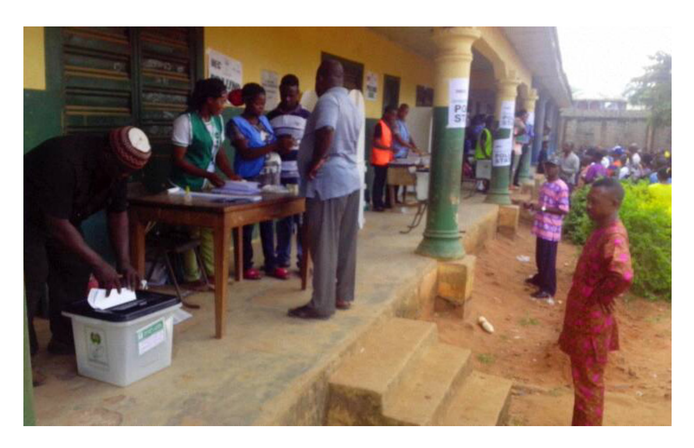
Anambra governorship election 18th November 2017

Low voter turnout may be attributed to many factors including hopelessness or lack of trust of eligible voters in the electoral system to bring about pro-poor leaders, over-securitization of the Election Day activities which may have created artificial fears in voters, IPOB factors, among others. It has become important to interrogate why voters continue to develop apathy towards elections in Nigeria. This deserves a rigorous and systematic investigation given the dynamic nature of the country's electoral system.