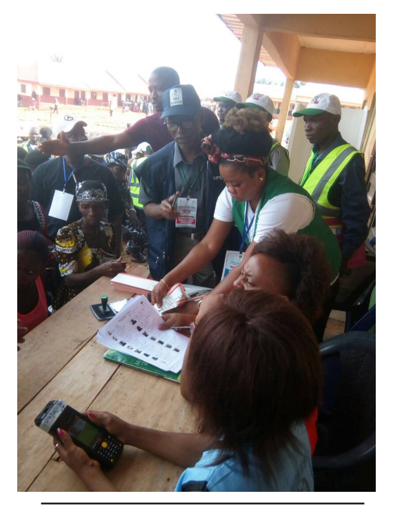
Voter's accreditation process