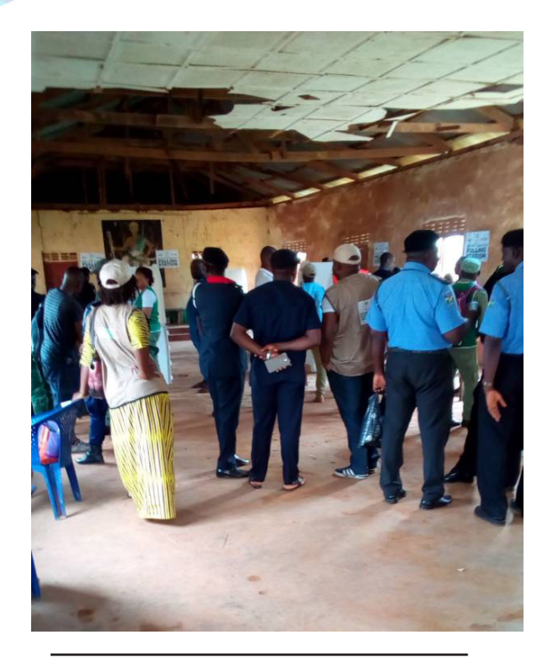
Polling unit results of the election been announced